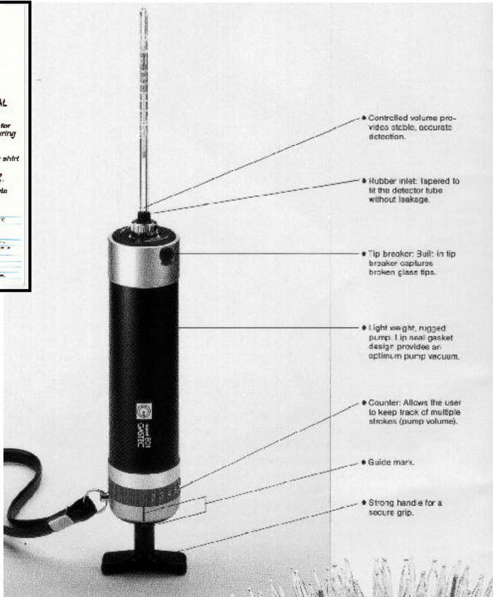
GAS ANALYSER FOR CHECKING ETHYLENE & CO2 LEVELS

RIPENING ROOM INSTRUMENTATION SUPPLIED BY VENTECH AGRIONICS - Call us on for details TEL +27(0)15-962-4203 or 4953 FAX +27(0)15-962-4110 email ventech@lantic.net