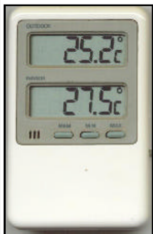
DIGITAL MAX-MIN THERMOMETER